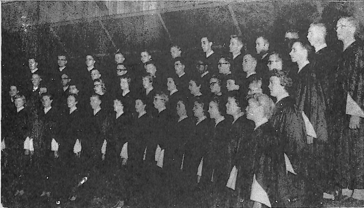
"Dress rehearsal" for the 1959 a cappella touring choir.