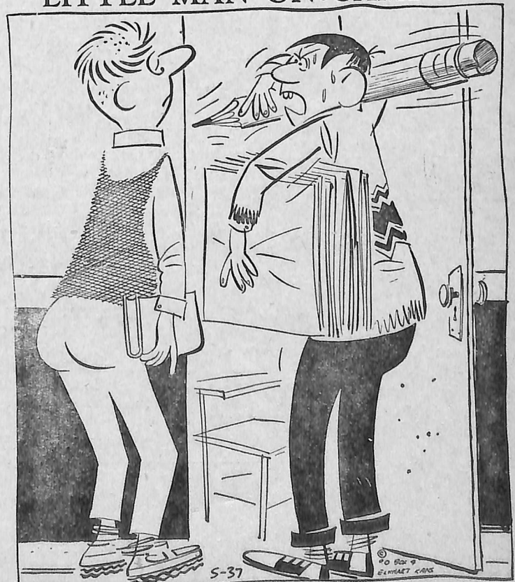
"HE NOT ONLY GIVES A LOUSY LECTURE — BUT HE EXPECTS YA TO TAKE NOTES ON EVERYTHING HE SAYS!"