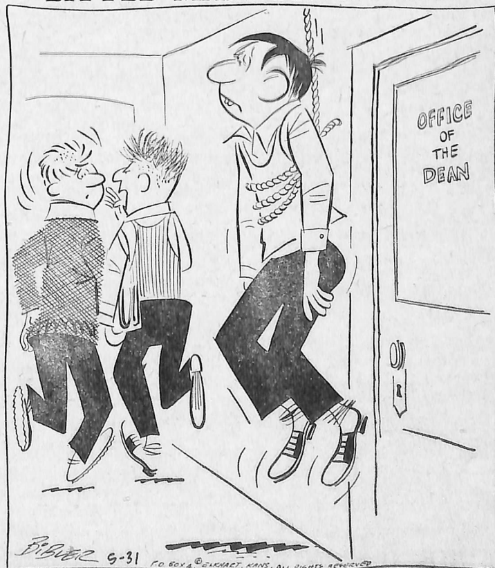
"I UNDERSTAND TH' DEAN HAD HIM SUSPENDED FOR THE REST OF TH' TERM."