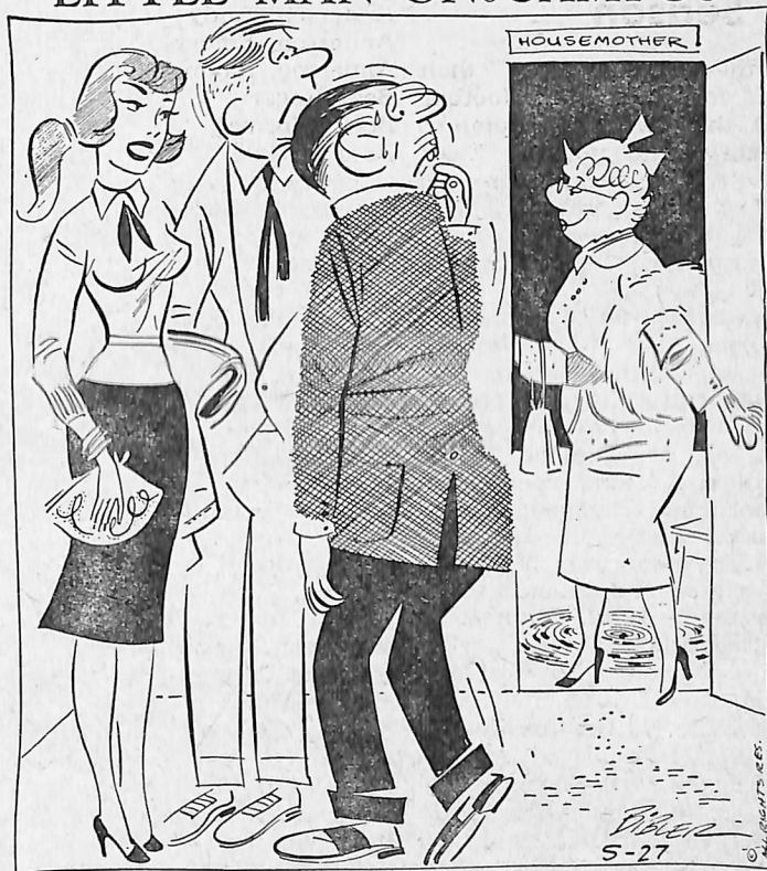
"I FINALLY GOT A BLIND DATE FOR YOUR FRIEND HERE — WE CAN EVEN STAY OUT PAST CLOSING HOURS."