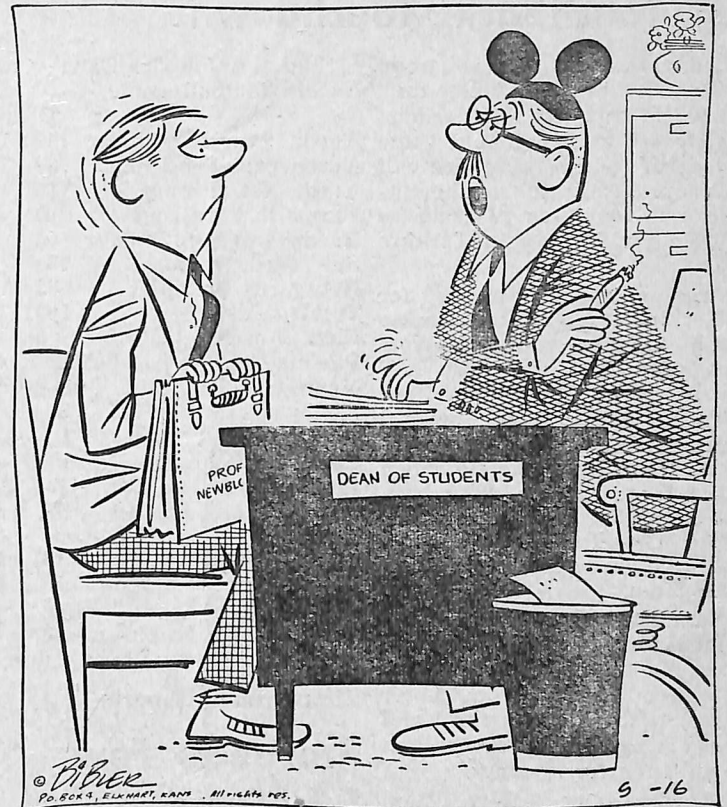
"IN ADDITION TO REGULAR TEACHING ASSIGNMENTS - ALL FACULTY MEMBERS ARE EXPECTED TO SPONSOR A CLUB."