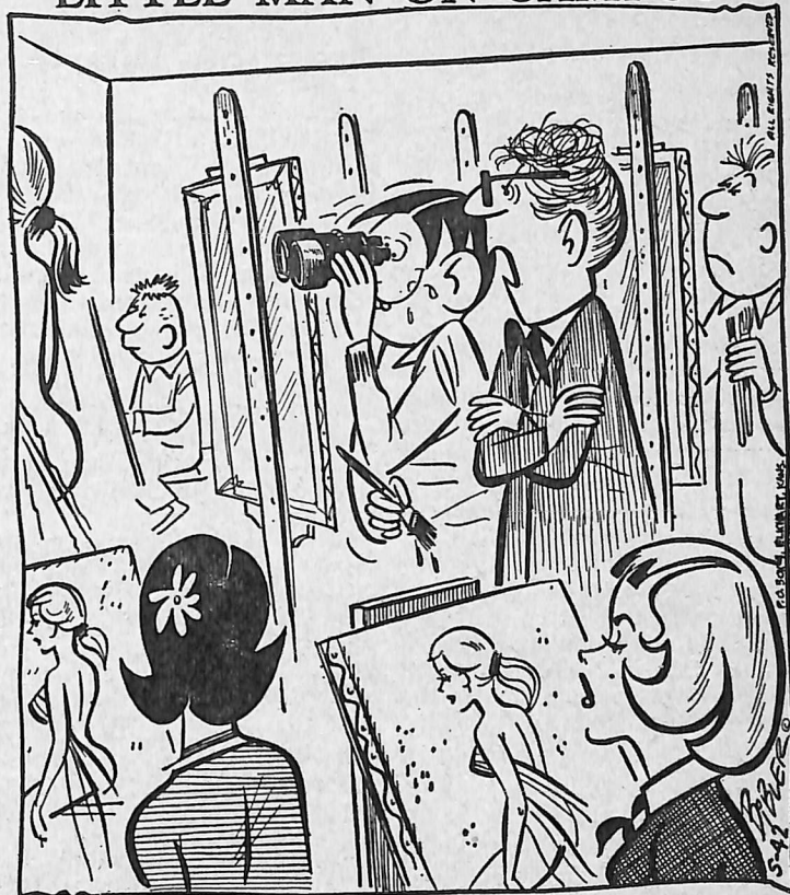
"WELL, IF YOUR EYES ARE THAT BAD - WHY DONCHA GET GLASSES?"