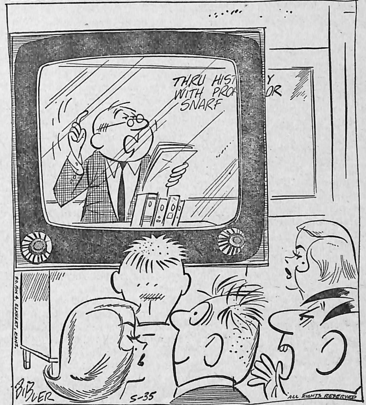
"-AT LEAST HE'S TRYIN' TO HOLD OUR INTEREST."