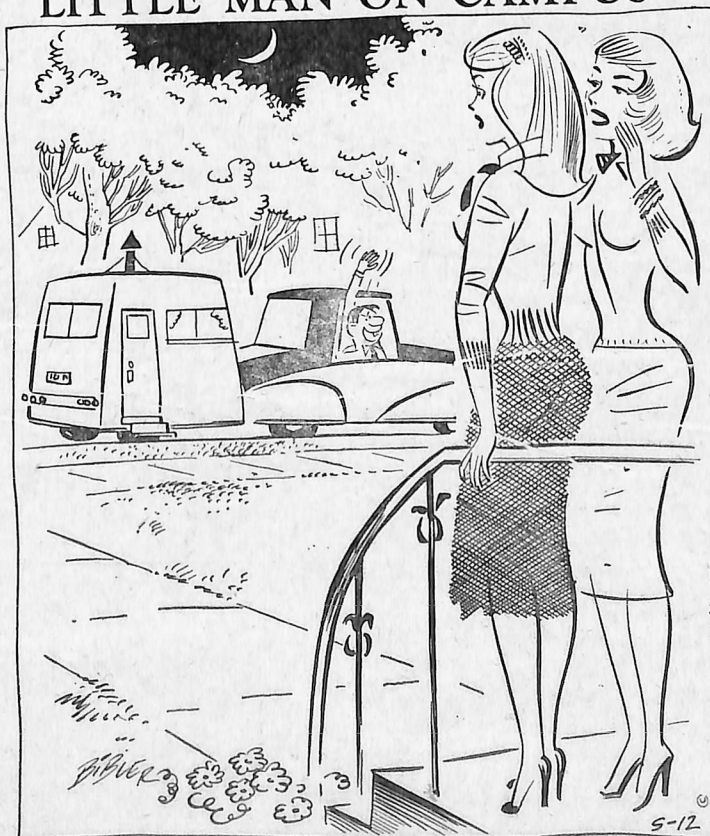
"REMEMBER — AFTER TH' MOVIE DON'T LET HIM TALK YOU INTO GOING TO HIS APARTMENT TO SEE HIS ETCHINGS."