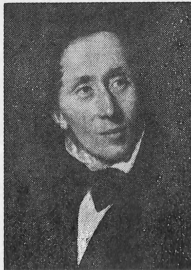
Hans Christian Andersen

Five years ago on April 2, 1955, five young Beech trees were dedicated and planted in the small grove between towering Old Main and Pioneer Memorial. They were to honor the memory of one of the world's greatest writers, Hans Christian Andersen. The Beech trees were small and insignificant in comparison to those that surrounded them, but they were a part of Denmark; a gift from the city of Odense, the birthplace of Andersen, and have now become a part of Dana.