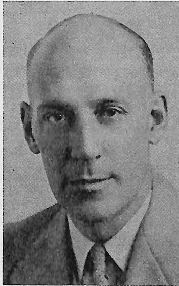
Director of Athletics