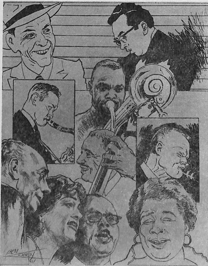
Winners of both the Playboy Jazz All-Stars and All-Stars' All-Stars polls, shown clockwise, from top: Frank Sinatra, male vocalist; Barney Kessel, guitar; Gerry Mulligan, baritone sax; Ella Fitzgerald, female vocalist; Lambert, Hendricks and Ross, vocal group; Stan Getz, tenor sax. In center, top to bottom, J. J. Johnson, trombone; Ray Brown, bass.

The winners of the All-Stars' All-Star awards are: Leader: Duke Ellington; Trumpet: Dizzy Gillespie; Trombone: J. J. Johnson; Alto Sax: Cannonball Adderley; Tenor Sax: Stan Getz; Baritone Sax: Gerry Mulligan; Clarinet: Buddy DeFranco; Piano: Oscar Peterson; Guitar: Barney Kessel; Bass: Ray Brown; Drums: Philly Joe Jones; Miscellaneous Instrument: Milt Jackson, vibes; Male Vocalist: Frank Sinatra; Female Vocalist: Ella Fitzgerald; Instrumental Combo: Miles Davis Quintet; and the Vocal Group: Lambert, Hendricks and Ross.