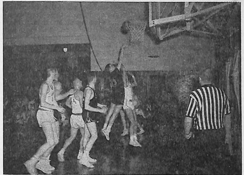
Viking reserves played an important role in the 89-80 Midland defeat last Saturday night as Dana cleaned house for its seventh conference victory.