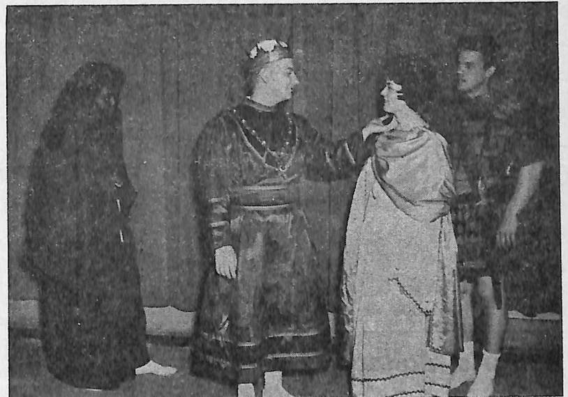
Salome: This is no time for endearments, Herod