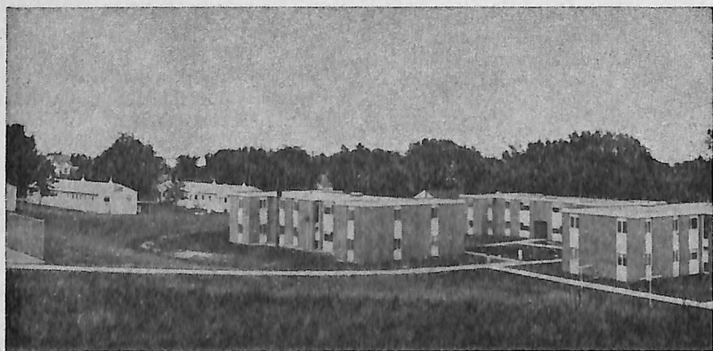
Modern 'tepees' of Omaha Village

Obviously, it is impossible to make an explanatory speech to every casual passer-by, but it would be possible to relieve some of the confusion simply by re-naming the individual buildings of "the Village." Re-naming them, that is, something far more picturesque than "Units A, B and C" which show a rather definite lack of imagination. And I don't mean to propose that they be called "East, West and South Halls!" These still, less-than-imaginative names would only add to the confusion because of the North and South men's residences.