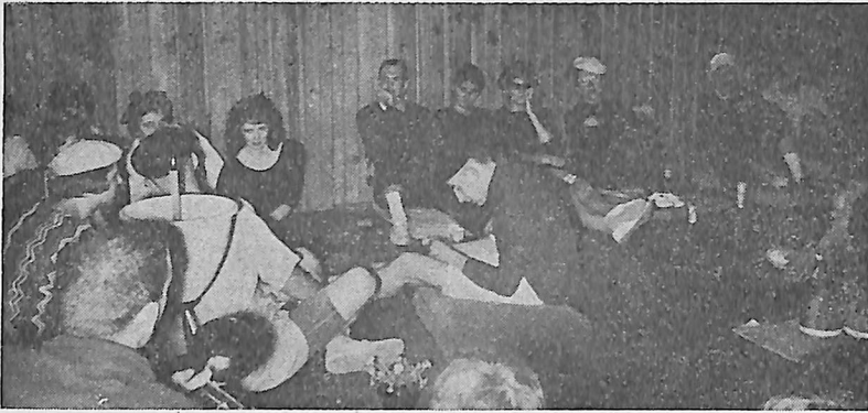
Like, those cats are beat. And if you're hep you'll shuffle on down in your go-clothes at 8 bells on the fifth of seven. All the cats and cool dads will be there with beat bits. Like, gone, man!