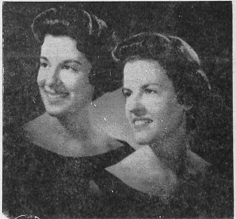
These famous twin duo-pianists were born in Williamsport, Pennsylvania, in 1938. Their musical training began at the age of five when they showed an interest in the piano. Their teacher soon recognized their talent. In the succeeding years, they received the Paderwski Gold Medal, High School Diploma and scholarship for superior ratings in the National Piano Guild Auditions.