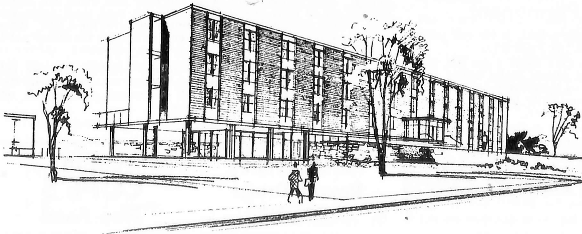
Pictured to the left is the new Boys' Dorm that will be located south of Holling Hall.