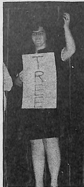
Rustle, Rustle . . . .