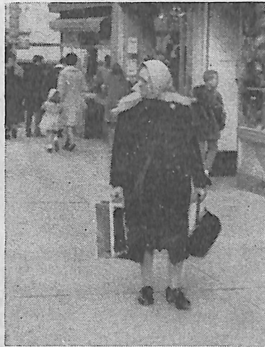
Silver bells, Christmas bells, Bright lights, shiny finsel. All those kids hurrying and scurrying; Christmas a go go.

Special effects are credited to the art department and the technical crew of the drama department.