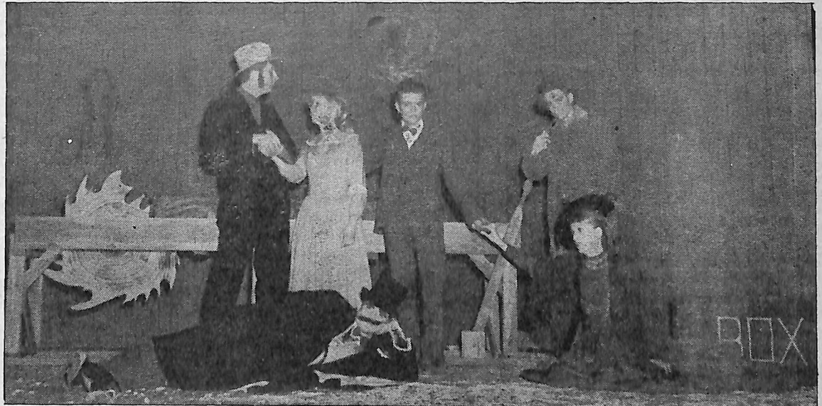
'A Peanut Hit You Where?' (Review on page 2.)