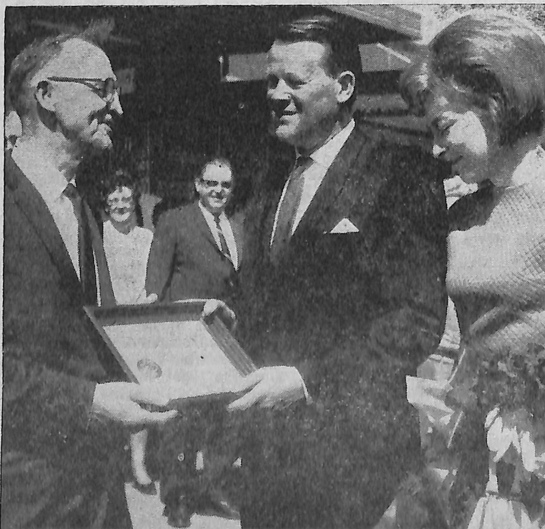
Mayor Harvey Simpson, left, expresses a Welcome from the City of Blair to Prime Minister Jens Otto Krag in a street