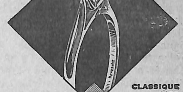
CLASSIQUE $180 ALSO TO $1975 WEDDING RING 29.75