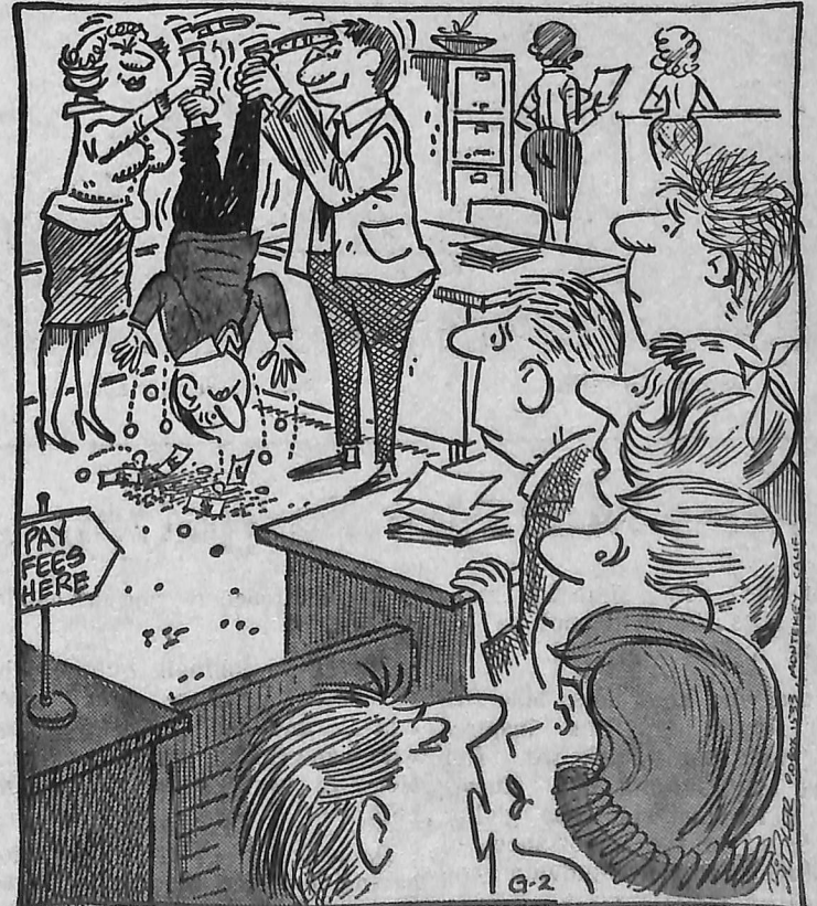
"I'LL BET THEY RAISED TH' TUITION AGAIN THIS YEAR."