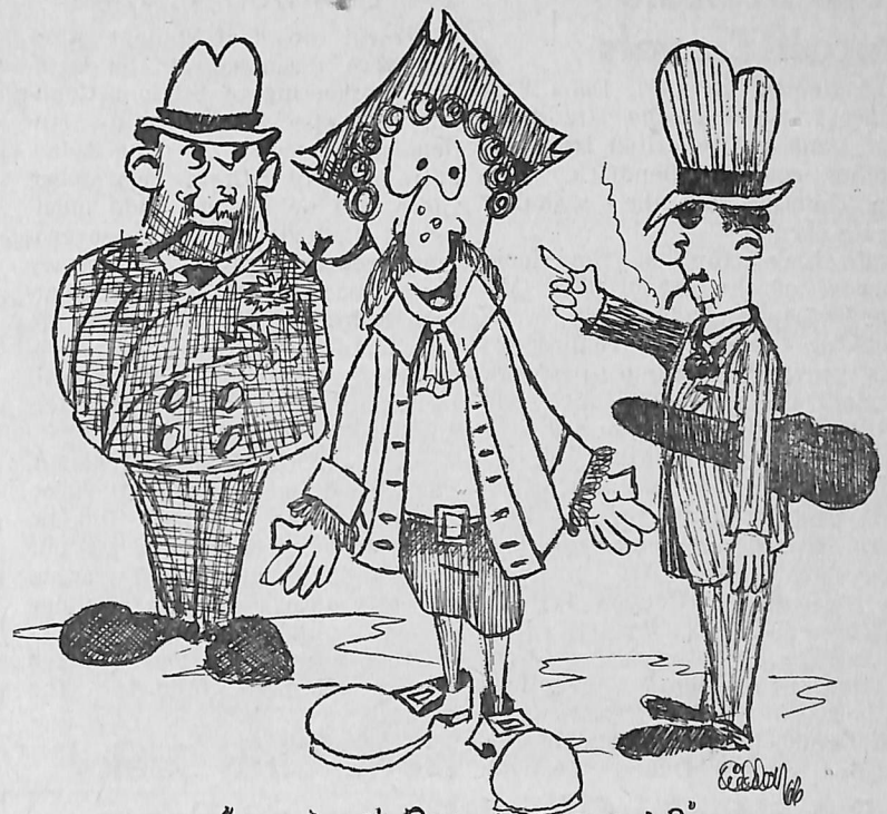
"How bout Roaring 1720's?"