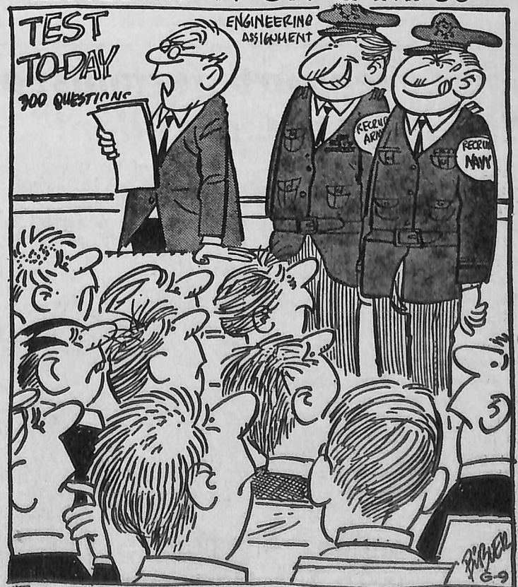
"I HOPE YOU FELLAS HAVE ALL STUDIED HARD FOR THIS TEST—THESE GENTLEMEN ARE HERE TO GRADE TH' PAPERS."