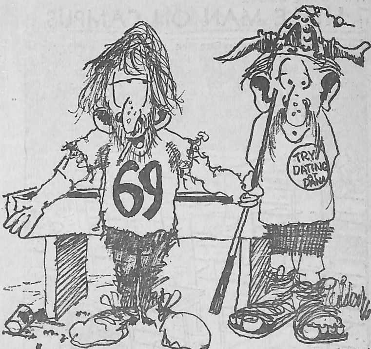
"THEY JUST AREN'T MATURE ENOUGH, THAT'S WHY"

The Vikings will travel to Doane on December 16.