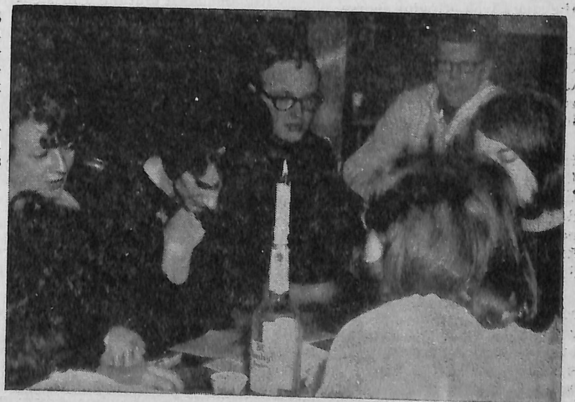
Student's enjoy Coffee and Conversation at Kiva