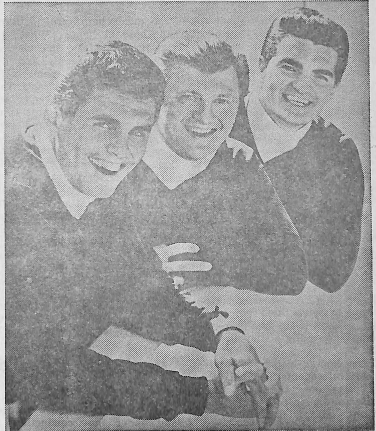
Outstanding Capitol Recording group—the Lettermen.

Another event sponsored by the Social Committee is the movie, "The Killers", it will be shown in D.H.A. this Saturday night at 7 p.m. and 9:30 p.m. The movie is in color and stars Lee Marvin. Admission is 25c per person.