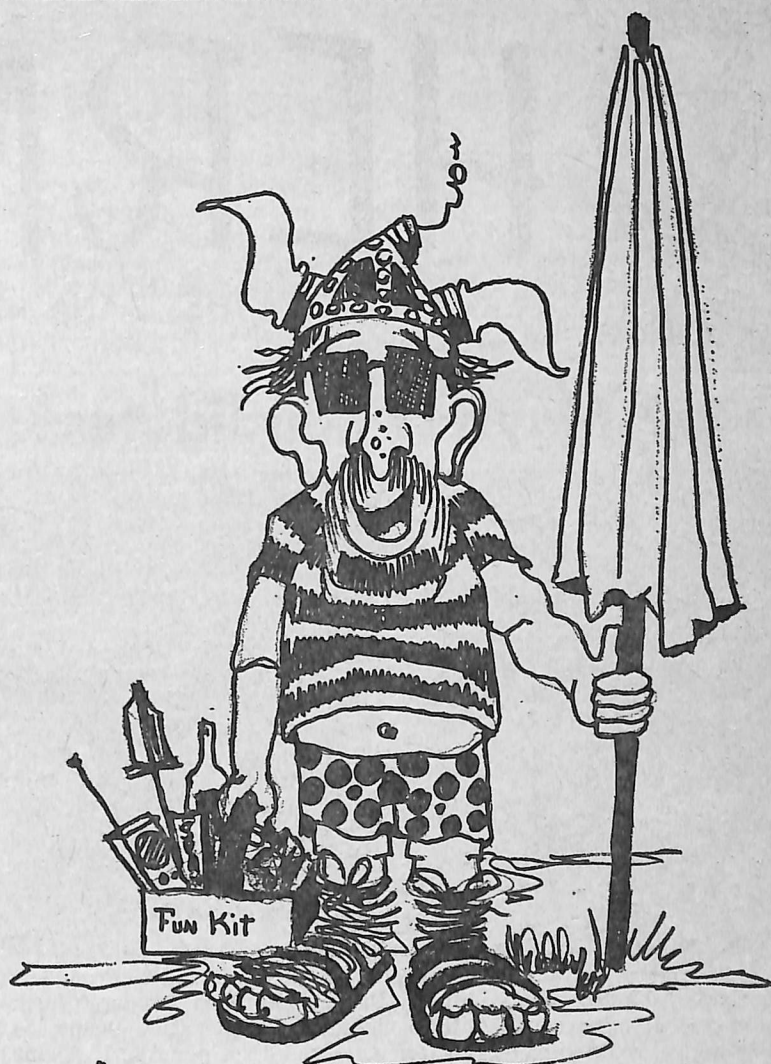
"If anyone asks, I'll be working on two term papers and studying for an exam"