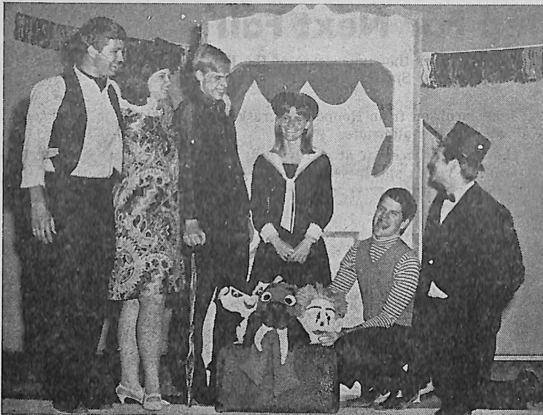
Carnival puppets ham it up with cast members.