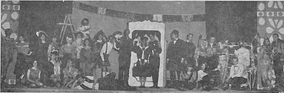
CARNIVAL CAST LINE-UP