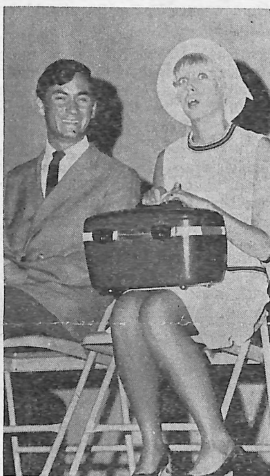
Well! Here we are!