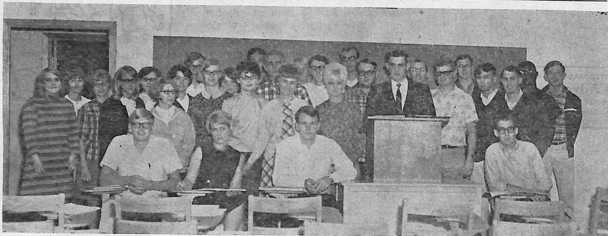
Student Council officers and representatives are shown at the first meeting of the year.

The freshman class is the only class yet to select officers.