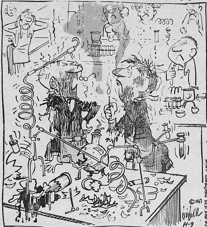
"— TAKE THE REST OF TH' PERIOD OFF — TOMORROW, HANG AROUND TH' STUDENT UNION — NEXT DAY TAKE IN A MOVIE — BEGINNING TO GET TH' PICTURE, WORTHAL???"