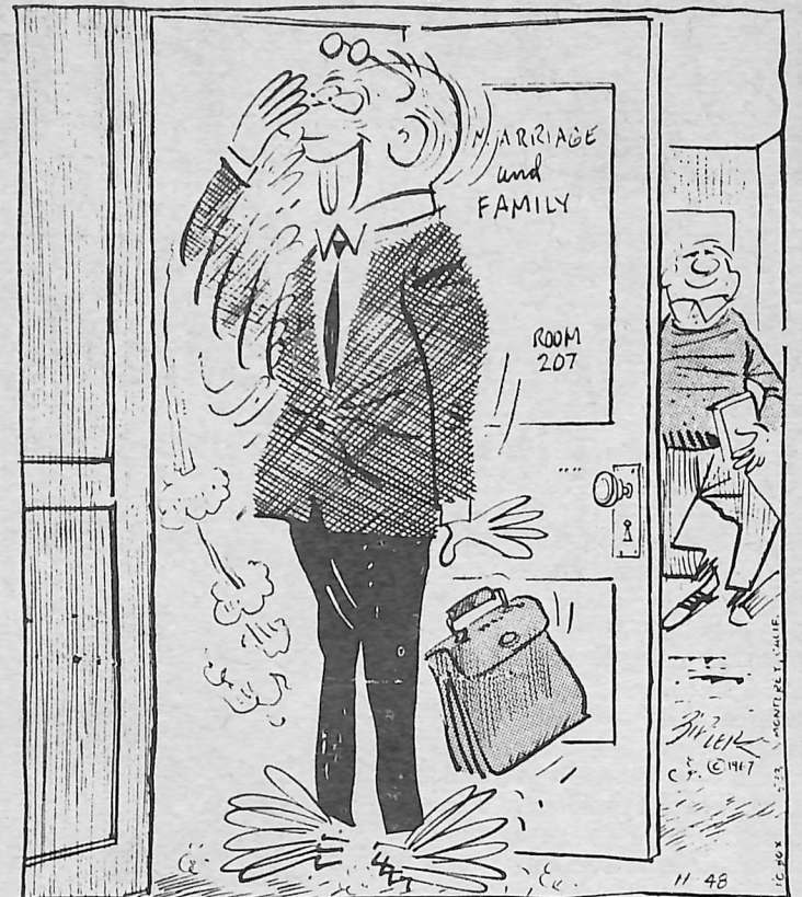
"Ooops! SORRY, PROFESSOR—I DIDN'T KNOW YOU HAD A CLASS IN HERE THIS PERIOD!"