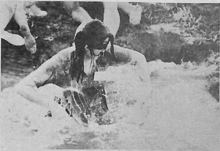
A bath once a semester, needed or not.