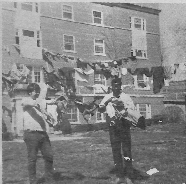
Elkhorn airs its differences.

a Berkley of the Midwest. With help from the Big Six we elected a liberal president, waxed the floor in Mickelsen Hall, got fast and efficient service on our dryers, allowed kids to get together in their rooms on the weekends for STUDying. And above all else, we saw the Business office loosen up on the purse-strings and now they will be more than willing to support the students' demand for money spending programs. And again I have been up on the hill looking for that damn light. And as the four year saga draws to an end I still haven't seen that light. Have you ever thought that those Danes might just be setting over there in Denmark laughing at us? There were times over the last four years when I was up on that hill when I thought I saw some kind of light, but it was only the match set to the Zig-Zags.