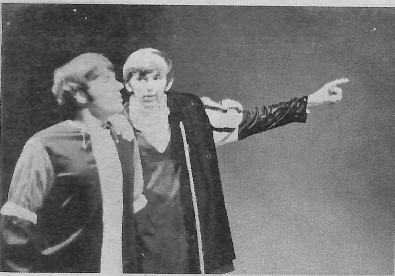
The Navy wants You!!