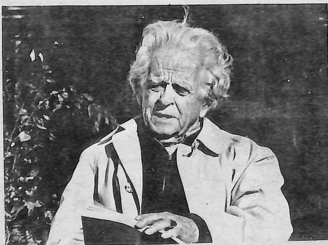
John G. Neihardt

slides will present a broad but rounded picture of the cultural, social, and economic life of Iceland today, setting all of this in a firm historical and geographical context. His discussion will involve natural resources, industries, politics, governmental organization, trade and communications, living conditions, and the literary scene.