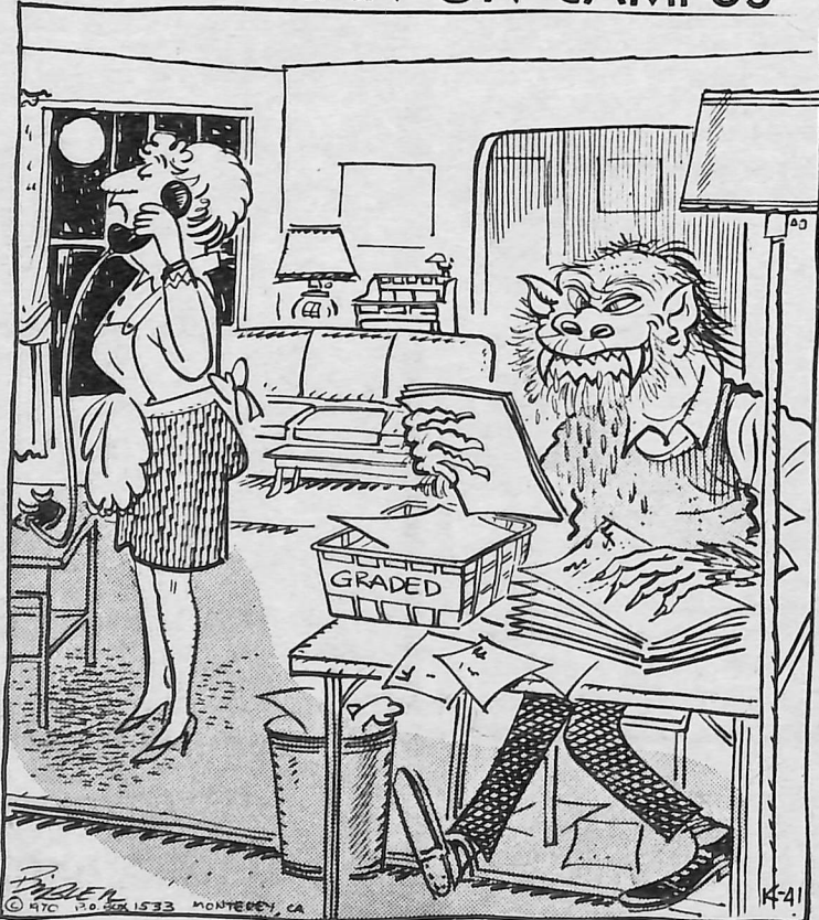
"BUT IT'S A FULL MOON, CHARLEY ~ YOU KNOW SIDNEY ALWAYS RESERVES THESE NITES TO MAKE OUT TESTS & GRADE PAPERS."