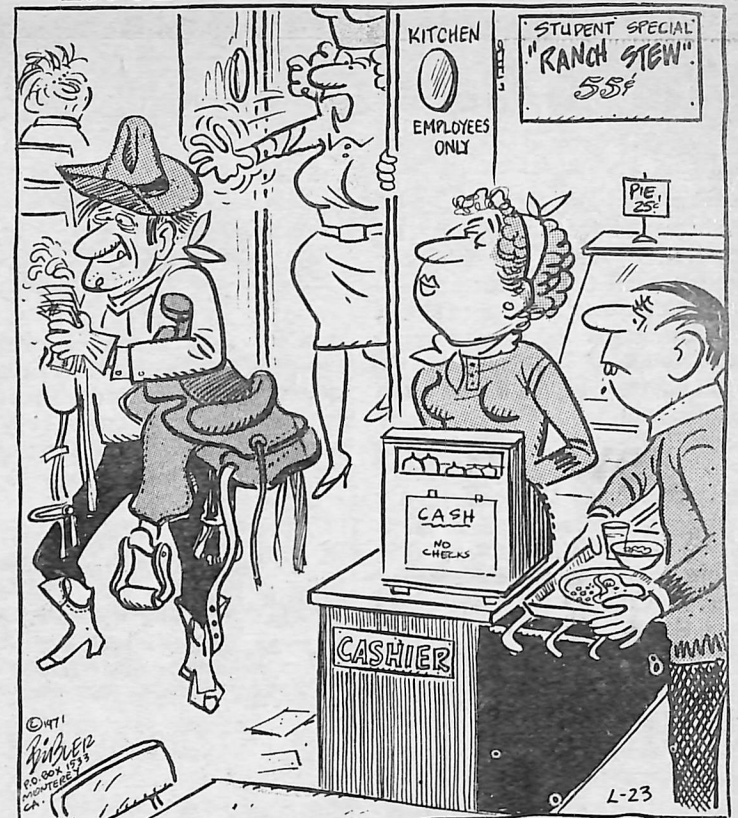
"NOT THAT WAY, STUPID - OUT TH' BACK DOOR."