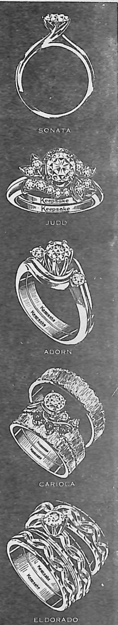
Rings from $100-$10,000 T-M Reg. A. H. Pond Co.