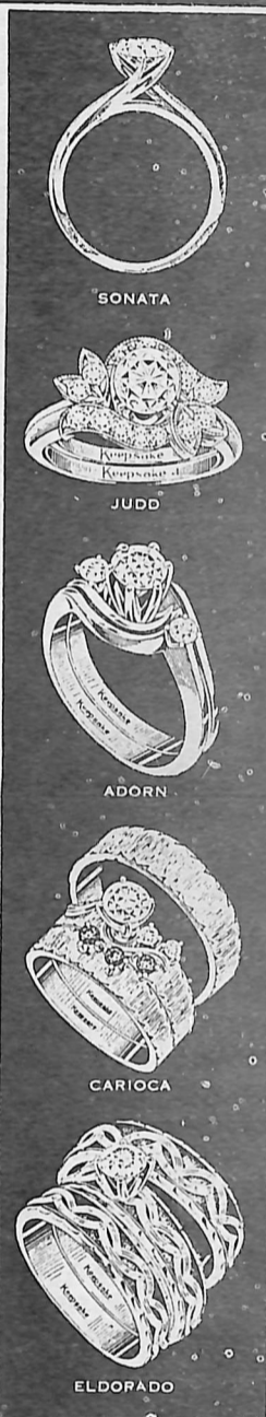
T-M Reg. A. H. Pond Co.