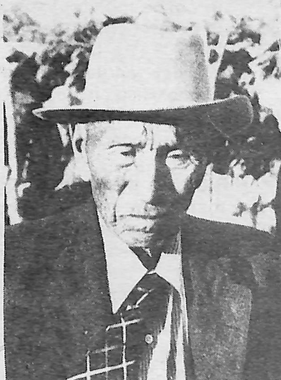
Nick Black Elk as he appeared at Pine Ridge, South Dakota in 1945.

"For the past forty years I have been engaged in furthering the humane teaching of the Sioux Indian seer, Black Elk. It is now spread widely not only over the United States but over Europe. Its influence has been great and I am sure that the influence will be enhanced by the proposed magnificent monument. The following lines from this inspired man will help