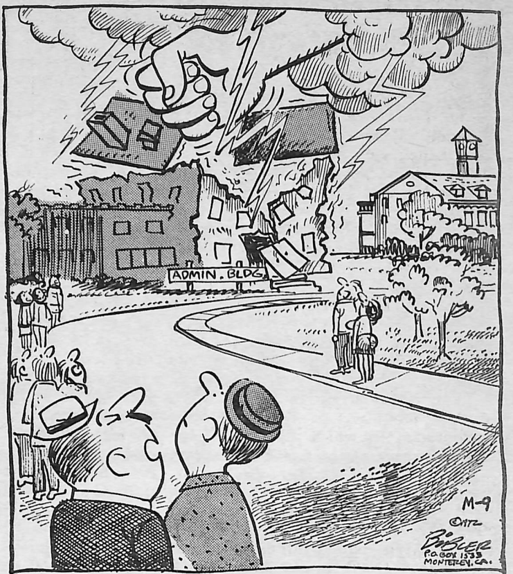
"ON THE OTHER HAND PERHAPS WE DO HAVE A MORAL OBLIGATION TO INVESTIGATE THEIR DEMANDS."