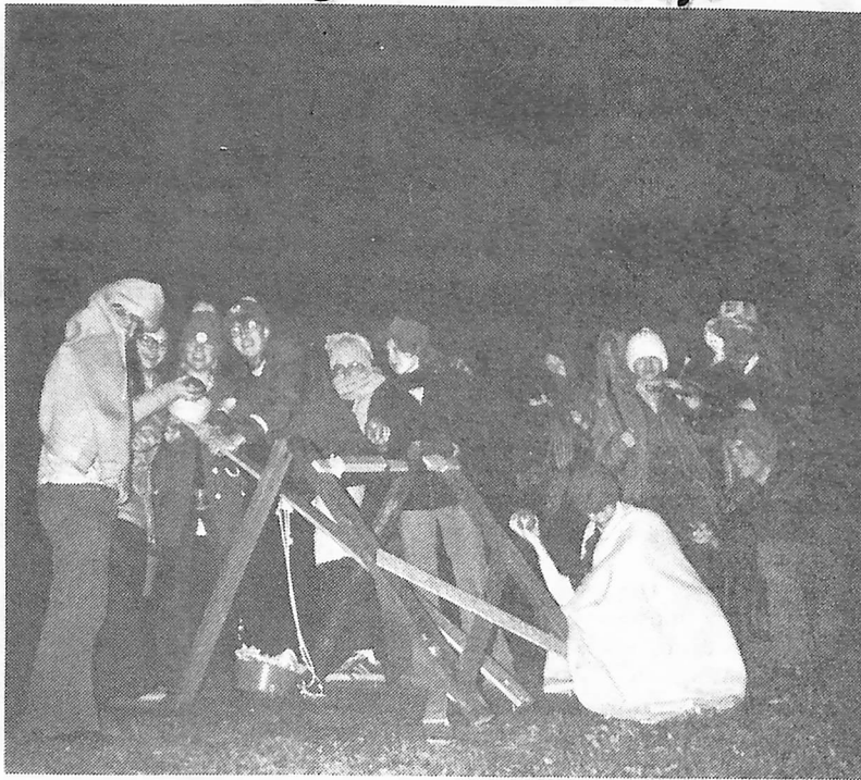
Not all Dana students are eager to take to the current fad of streaking. This group of students posed for the camera while assembling near Old Main last week. They represented the non-streaking faction on campus. With a waterballoon-loaded catapult and four garden hoses, they waited to "cool off" some of the streaking fever.