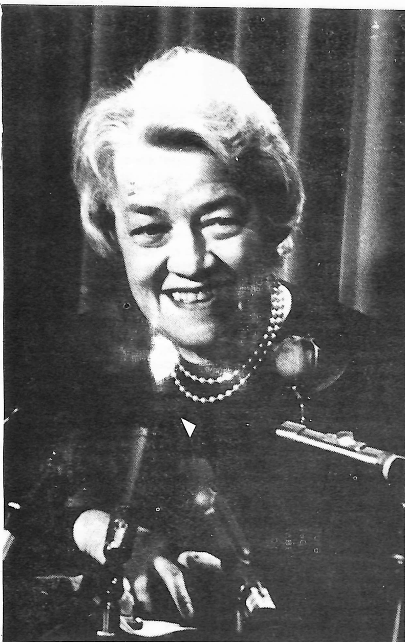
Margaret Chase Smith will visit the Dana Campus as a Woodrow Wilson Visiting Fellow, on November 11-14.

meet with students to field any ideas or questions from 12:30 - 1:15 p.m. in the Linden Room