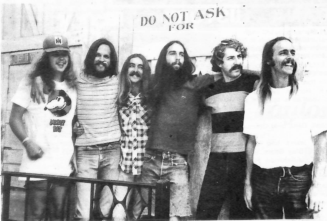
The Ozark Mountain Daredevils will be in concert at Dana November 19 in Borup Coliseum. Tickets are $2 for Dana students, $4 for non-students and $5 at the game.