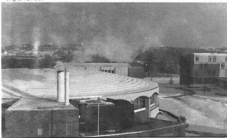
Snow finally came to Dana last week, when many were beginning to wonder whether or not winter would arrive. In this scene the campus and surrounding countryside is shown with its blanket of white. Snowballs were thrown, hills were sledded down and snowmen (and bunnies) were made. The snow is nearly gone from the campus and students are now anxiously waiting spring.

The slow lament "You See Me Crying" (about a lover's rejection) and the rhythm and blues ditty "Big Ten Inch Record" help show that Aerosmith's material is pretty diversified. Overall, Toys in the Attic is a remarkably clean, raw, and delicious rock album.