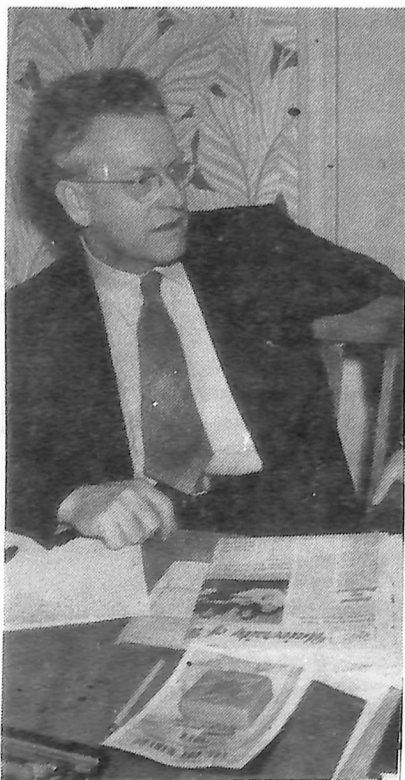
The author in the 1930's at the time he was writing the Nebraska novels.