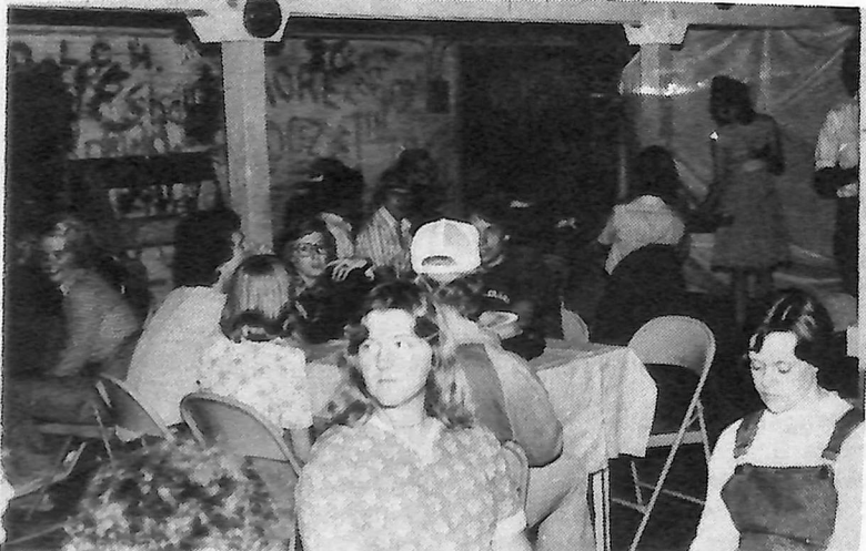
The Dana Players held a meeting to encourage interest in drama. These students met in the basement of AMA to discuss last year's performances and coming productions.

On Saturday, October 9, the Blair Chapter of the Danish Brotherhood in America will sponsor their second annual Danish Day. Most of the activities will be held at the Blair Fire Hall, and exhibits will include the Nebraska Bi-Centennial Tapestry, Traesko (wooden shoes), weaving and spinning, rosemaling, straw art, and Danish antiques. Visitors will be entertained by a children's story hour, Dana's Danish dancers, and there will be plenty of authentic Danish food on hand including open-faced sandwiches to be sold by the Danish Club. Other highlights of the day will include a raffle of Danish plates and figurines, and two contests: one for bread baking, and one for Danish costumes. A dance will be held that evening in the Blair Fire Hall.