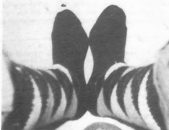
Who EVER heard of feet on the front page? Turn to page 3 and discover the rest of the story!!