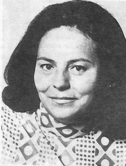
LaDonna Harris will be one of the speakers in Parnassus on Saturday, March 11, at 8 p.m.

Ms. Harris has long been active in the field of minority rights. In 1967 she was appointed by Sargeant Shriver as Chairman of the Women's National Committee Against Discrimination in Housing, a member of the National Committee on Household Employment, a member of the National Rural Housing Alliance and a member of the Executive Board