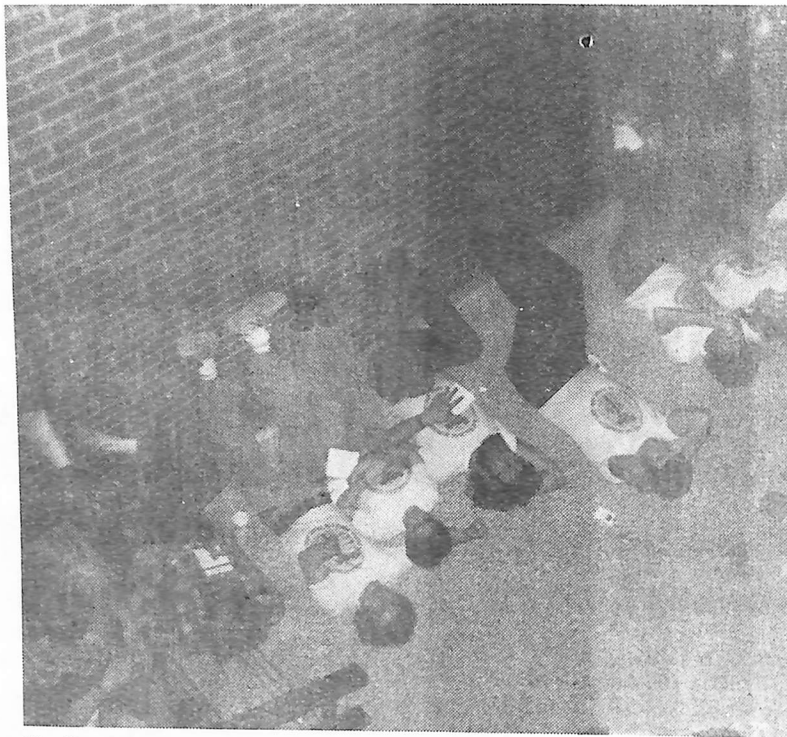
The first break put a lot of tired feet up in the air. What was the last break like?!