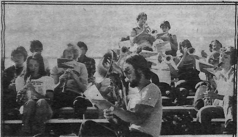
Band anticipates tour. See story page 3.