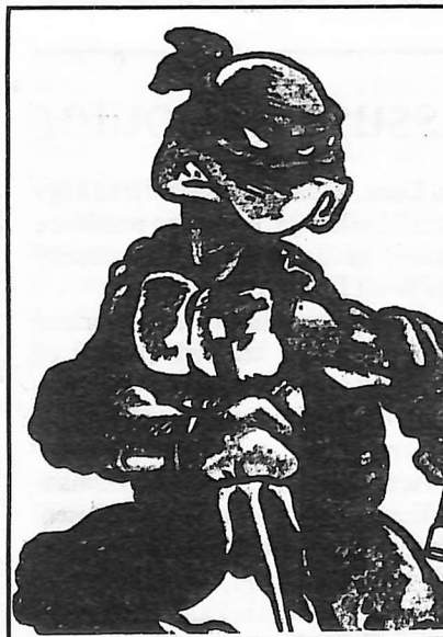
Teenage Mutant Ninja Turtle: Raphael

The Shredder" or Tan Saki. The shredder takes in young boys and corrupts them into waging a crime wave across the city. To reward them he makes them warriors in his elite fighting unit "The Foot."