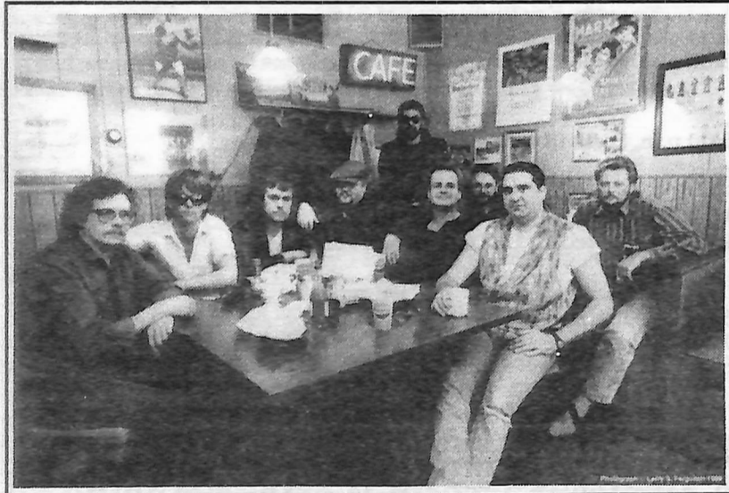
The Jailbreakers: Just one of the groups headlining Dana's Springfest "Mardi Gras Jazz Weekend." The concert is from 1 to 6:30 p.m. on Sunday on the Old Main patio.

So get ready to have more fun than you ever thought possible because it's Springfest and Mardi Gras Jazz Weekend 1990!