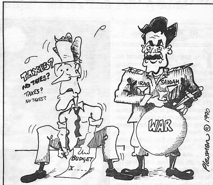
Sitting on the edge