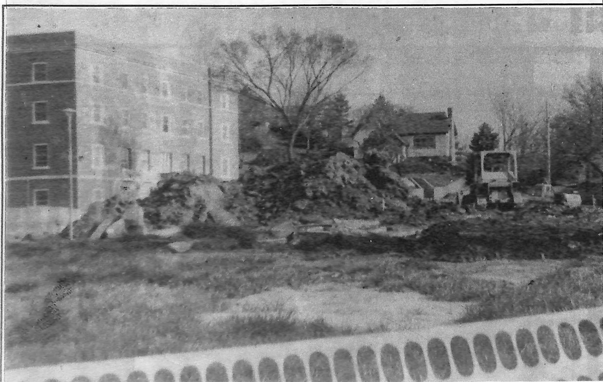
From snow to sun, the reconstruction is continuing.