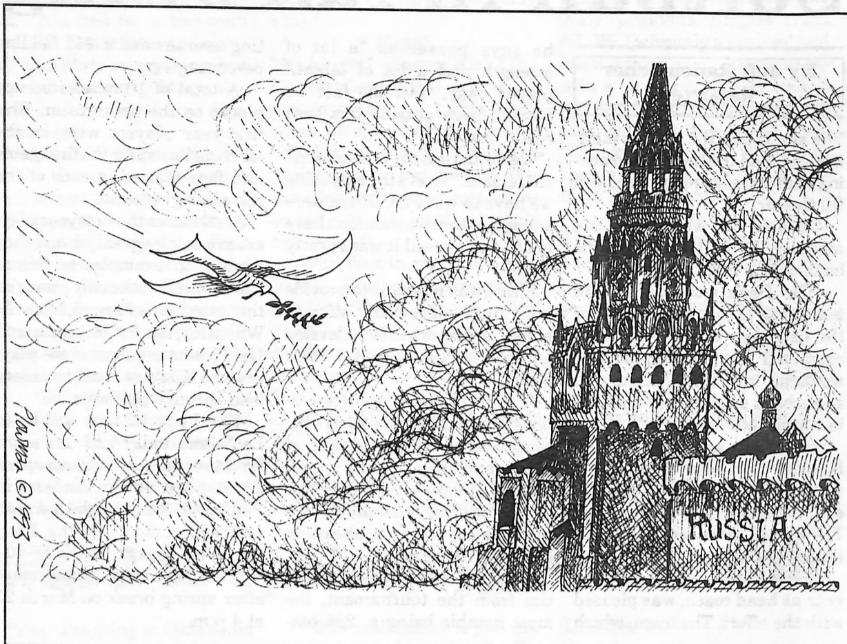
CLOUDS OVER THE KREMLIN

involved in the revenue base of a nation, if there is to be stability